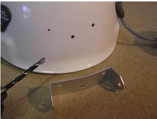
Prepared drillings for the lamp holder

We recommend leading the lamp cable on the inner side of the helmet. In that way the connector is well protected.