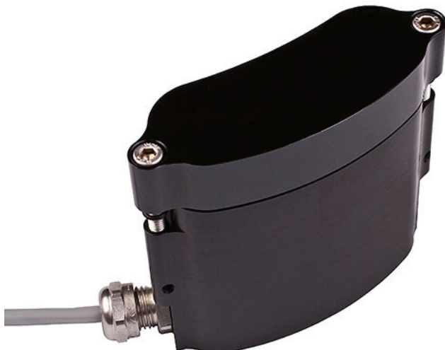
Battery case (for battery modules)

The Diving-Scurion® is delivered fully assembled and tested – i.e. head and battery casing are connected.