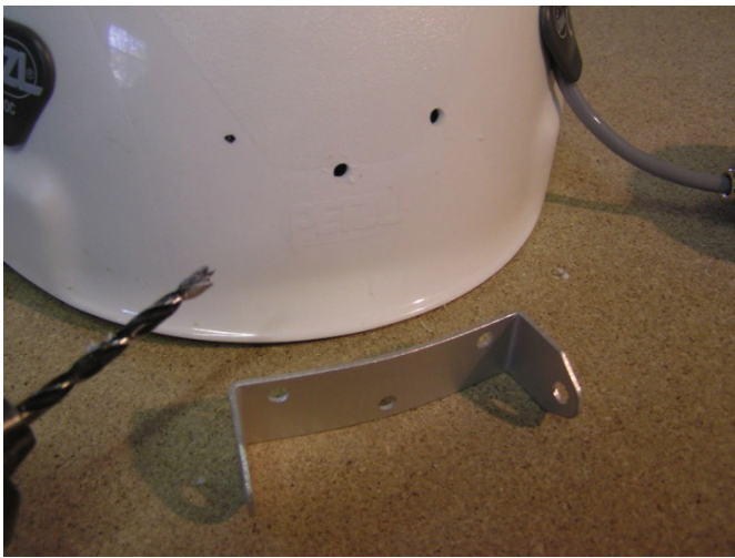
Prepared drillings for the lamp holder